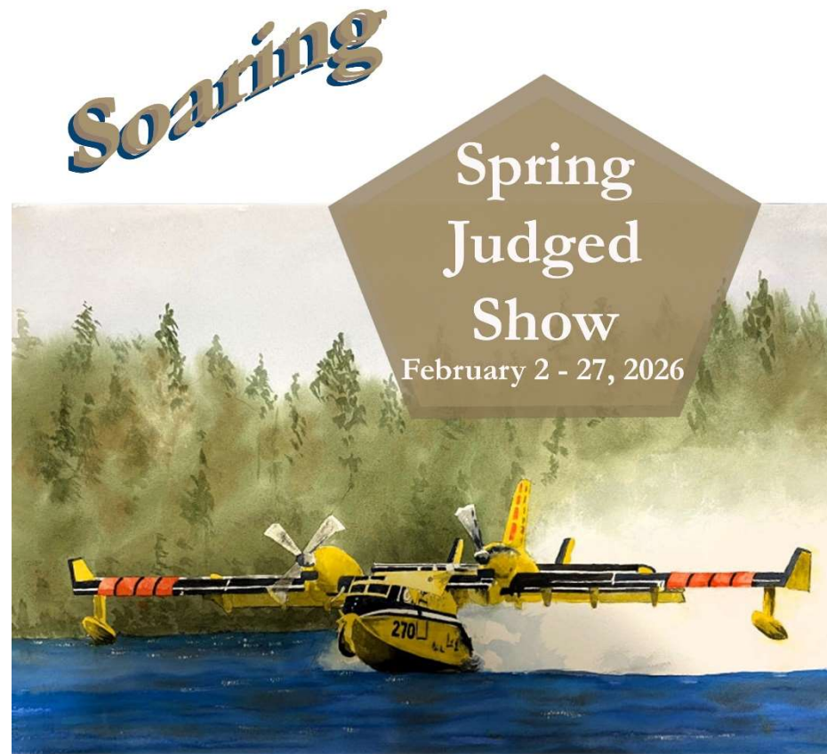
Painting by Irvin Hawkes